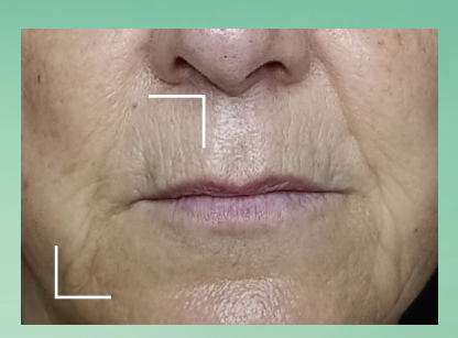
5 Professional Treatments + Beauty Routine (8 weeks)